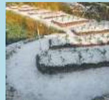
Fig.2 Snowflakes in the field of Kathmandu valley

During 15-16 January, 2011, snowfall occurred in some parts of the hilly regions of Nepal with the passage of western disturbances. Traces of snowfall also observed in the hills surrounding the Kathmandu valley such as Chandragiri, Nagarjun and Nagarkot. Some parts of the Kathmandu valley such as Chabahil, Thali, Mulpani and Changunarayan also received light and brief snowflakes along with some amount of rainfall. Snowfall is rarely observed in the capital Kathmandu. Last time, Kathmandu experienced snowfall on 14 th February, 2007 and 6 th January, 1945.