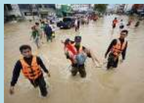
Fig.4 Rescue during flooding in Bangkok

Flooding persisted in some areas until mid-January 2012, and resulted in a total of 815 deaths and 13.6 million people affected. The World Bank has estimated US$ 45.7 billion in economic damages and losses due to flooding, as of 1 December 2011. The flooding inundated about six million hectares of land, over 300,000 hectares of which is farmland. The disaster has been described as the worst flooding yet in terms of the amount of water and people affected.